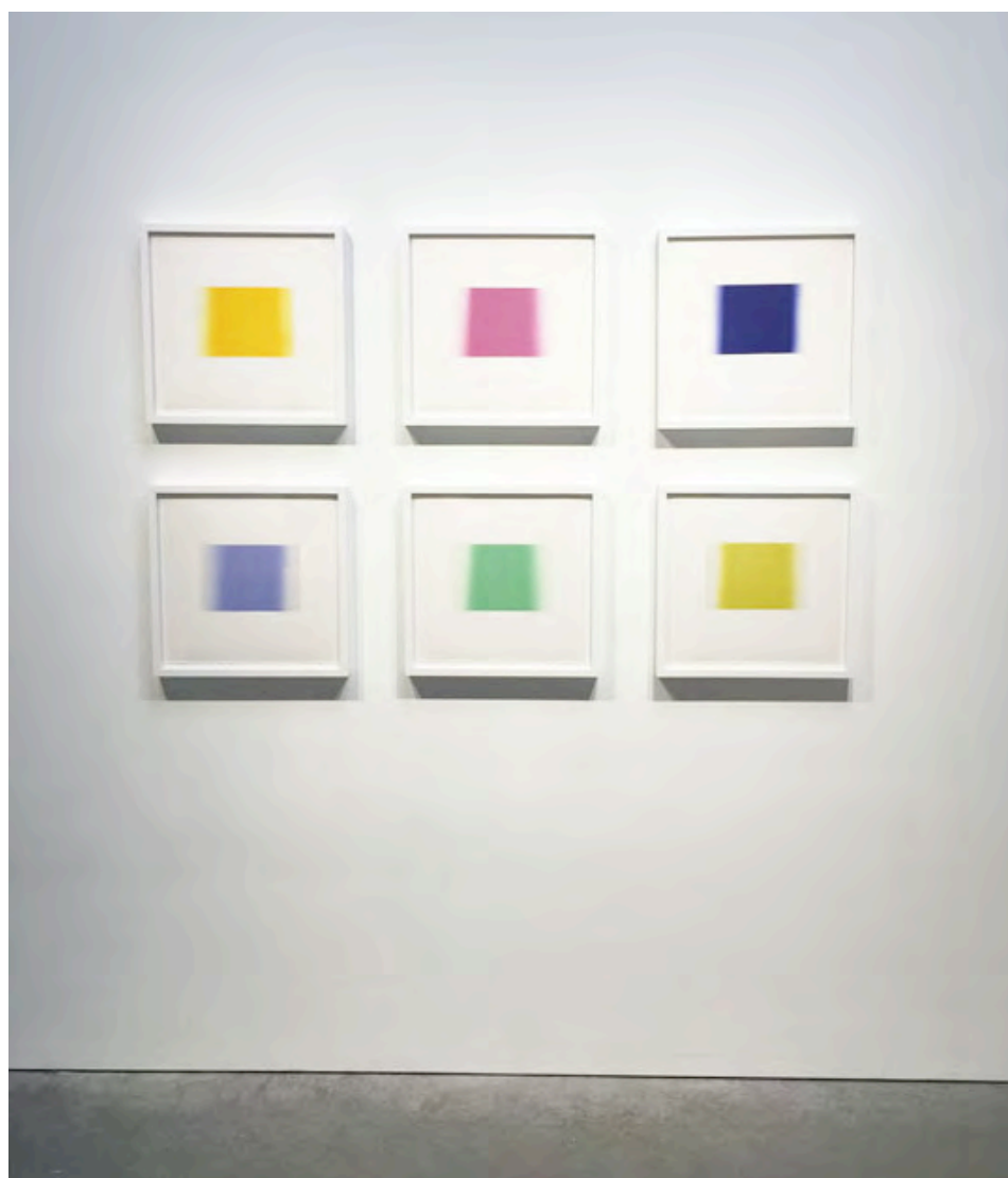
Betty Merken, Illumination Series , 2016 (Grid Installation View), Oil Monotype on Rives BFK Paper, 17 x 18 Inches Each, 63 x 39.5 Inches All

Betty Merken is an American painter and printmaker. Her work can be found in several galleries and numerous private and public collections in the United States, Asia, and Europe, and in the permanent collections of major museums, including the Fine Arts Museums of San Francisco (the de Young Museum and the California Palace of the Legion of Honor), the UCLA Hammer Museum in Los Angeles, and the Portland Art Museum in Portland, Oregon. Merken has been honored with fellowships from the BAU Institute in Otranto, Italy and New York and the Civita/Northwest Institute for Architecture and Urban Studies in Italy. She is the co-author, with Stefan Merken, of Wall Art , Megamurals and Supergraphics (Philadelphia: Running Press, 1987).