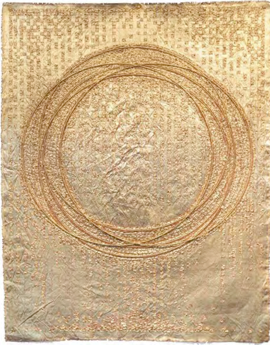
Andrew Fisher, Rain 2 , 2015, 24K Gold Leaf, Canvas, Steel Bars, Thread, 39.5 x 52 Inches