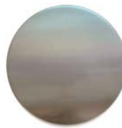
Purple Green Pink Shift Moon , 2020, Pigment, Urethane, Resin, Stainless Steel 40 Inches Diameter $28,000