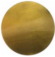
Full Moon , 2019 Pigment, Urethane, 23k Gold, Mica, Resin, Stainless Steel 48 x 48 Inches $34,000