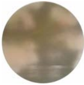
Nagare Boshi (Shooting Star) , 2020 Pigment, Urethane, 24k Gold, Resin, Stainless Steel, 24 Inches Diameter $13,000