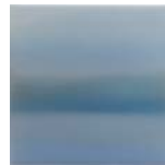
Hakanai (Fleeting) 1 , 2020 Pigment, Urethane, Resin, Aluminum, 24 x 24 Inches $13,000