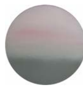
Pink Moon , 2020 Pigment, Urethane, Resin, Stainless Steel 32 Inches Diameter $22,000