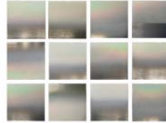
Spectrum Grid , 2020 Pigment, Urethane, Resin, Aluminum 36 x 48, 12 x 12 Inches Each $50,000