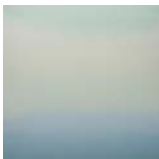
Hakanai (Fleeting) Shift , 2020 Pigment, Urethane, Aluminum 36 x 36 Inches $24,000