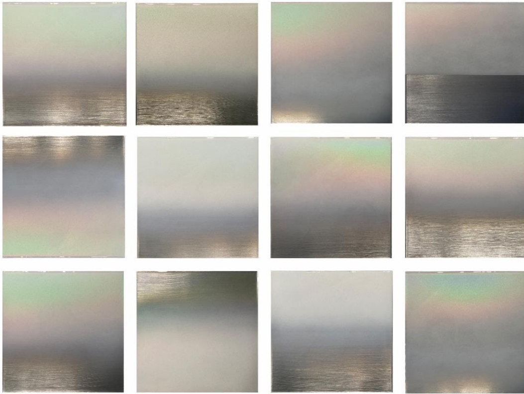
Miya Ando, Spectrum Grid , 2020, Pigment, Urethane, Resin, Aluminum, 36 x 48 Inches, 12 x 12 Inches Each

The foundation of Ando's practice is the transformation of surfaces. In this exhibition, she produces light-reflecting gradients on her metal paintings by applying heat, sandpaper, grinders, acid, and patinas, irrevocably altering the material's chemical properties. By an almost meditative daily repetition of these techniques, she is able to subtract, reduce, and distill her concept until it reaches its simplest form, conjuring presence from absence.