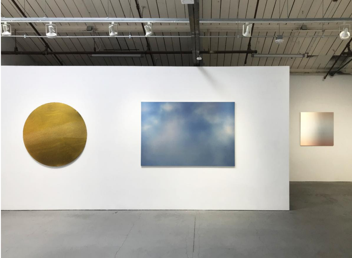
Miya Ando Equanimity (Meditations) Exhibition View at Nancy Toomey Fine Art

Exhibition Dates - July 8 to August 31, 2020